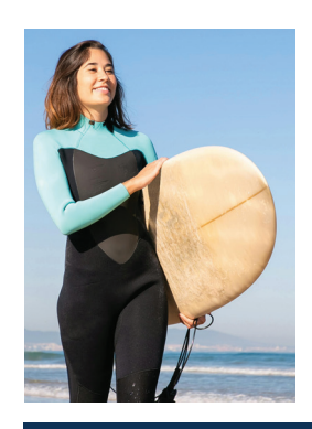
Super guarantee increasing to 12%... cont

This is great news for workers, because more super means more savings for retirement, and that can make a big difference later on.